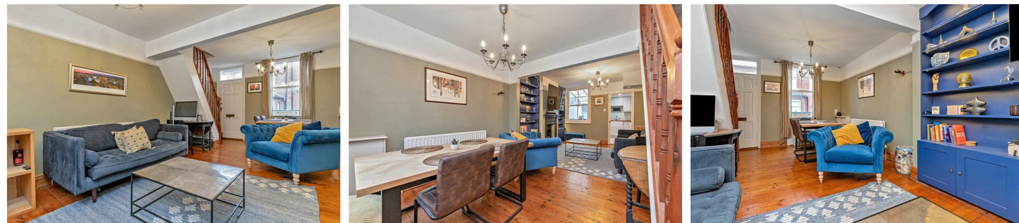
Ground Floor Approx. 395.7 sq. feet

CHAIN FREE - Discreetly positioned along a peaceful stretch of Inkerman Road, this beautifully presented two bedroom end-terrace cottage offers a rare combination of character, tranquillity, and city-centre living. Just a short stroll from the heart of St Albans and its mainline train station, the property enjoys an enviable lifestyle setting where historic charm meets modern convenience. St Albans city centre is renowned for its vibrant café culture, independent boutiques, acclaimed restaurants, and thriving market scene, all set against the backdrop of the iconic cathedral and leafy open spaces. Internally, the cottage retains a wealth of period features that create a warm and inviting atmosphere, complemented by a stylish four-piece bathroom suite. Outside, the rear garden provides a private retreat and benefits from gated rear access, adding both practicality and versatility. Offered to the market chain free, this charming home presents a wonderful opportunity to enjoy a relaxed yet connected lifestyle in one of Hertfordshire's most sought-after city locations.